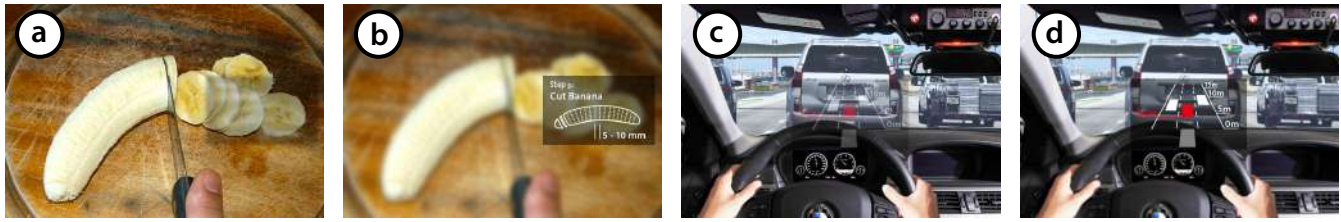
Figure 6. Illustrations of the cooking scenario (a and b) and the traffic police pursue scenario (c and d) from the first person point of view. (a,b) In the cooking scenario, putting the display in the middle-right allows the user to see the knife clearly while receiving cooking instructions on the HMD. (c,d) In the traffic police pursue scenario, putting the display in the middle-center allows the police to track the position of the pursuit vehicle on the HMD without turning the gaze away from the road. The scenarios demonstrate that task requirement is an important factor of the ideal display positions for a specific task.