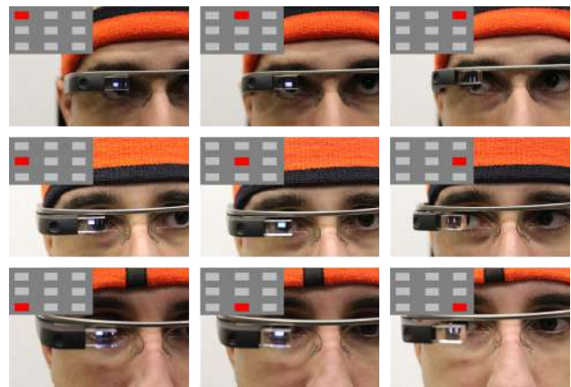
Figure 1. We investigated nine display positions on a monocular OST-HMD. The red rectangle on the diagrams located at the top left corner of each image indicates the display position from users' point of view.

off is an important issue in notification system design [12], and display position relative to the user's eye is an important human factor since different display positions necessitate different eye movements that are controlled and influenced by different eye motor and human habits (Figure 1) [2].