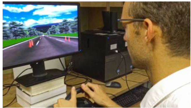
Figure 3. Physical setup – the participant's eye is fixed 50 cm away from the screen, providing a \sim 62^\circ horizontal viewing angle. Driving simulator is controlled with a racing wheel.

We used Google Glass (Explorer Edition 2.0) as the monocular OST-HMD since it is one of the few with a monocular form factor in the market. The experiment software was developed in Java with the Glass SDK to present stimuli and collect data. For the simulated driving primary task, we used a customized version of OpenDS, a reliable and easy to use open source driving simulator used by a number of HCI researchers [4]. Both the experiment software and driving simulator were run on a Windows-based PC (Intel Core i7 3.4GHz) with a 23-inch LCD monitor that provides \sim 62^\circ horizontal viewing angle from 50cm away. A Thrustmaster Ferrari GT Experience Racing Wheel was used to operate the driving simulator (Figure 3).